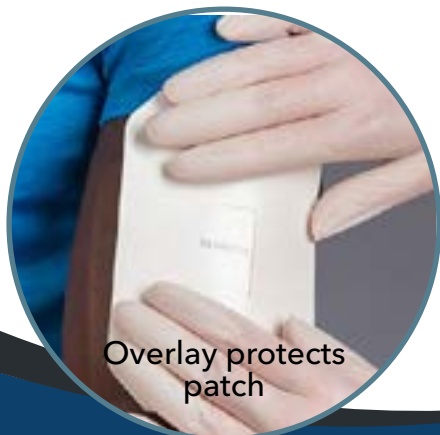
Overlay protects patch