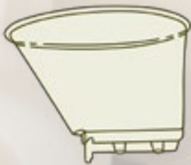
Alco-Sensor FST Cup (#353)