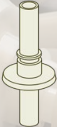
Alco-Sensor IV (#312)