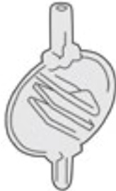
Guth Saliva Trap (#334)