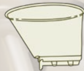
Alco-Sensor VXL Cup (#381)